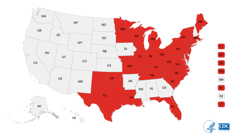
CDC Statistically Significant Increase from 2015 to 2016

B. Threat: The use and misuse of opioids have created direct consequences for our society, economy, and the general well-being of our public. Opioid deaths and addiction continue to climb across the state. However, the impacts of the opioid problem are not distributed evenly across the state. Higher instances of overdose deaths are concentrated in more metropolitan areas, including the Upstate (Greenville, Pickens, Spartanburg, and York counties), Midlands (Aiken, Lexington, and Richland counties), Lowcountry (Berkeley, Charleston, and Georgetown counties), and the Pee Dee (Horry County). These counties reported more than 25 deaths from overdose in 2016, with Horry County reporting 101 deaths from overdose. All counties in the state are experiencing a direct or indirect impact from these deaths, regardless of the number of incidents or location of these occurrences.